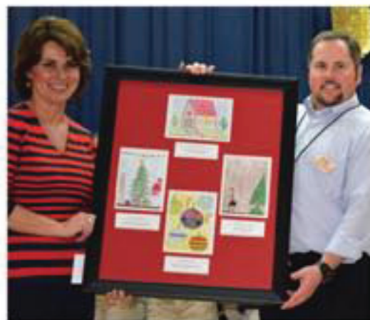
The school was presented a framed copy of all winning designs for display in the halls of the school.